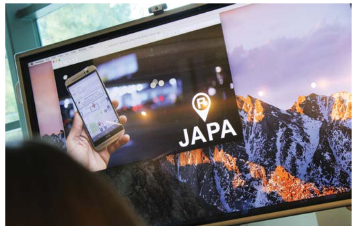
Team JAPA further developed their prototype at the 2017 Create-a-thon.